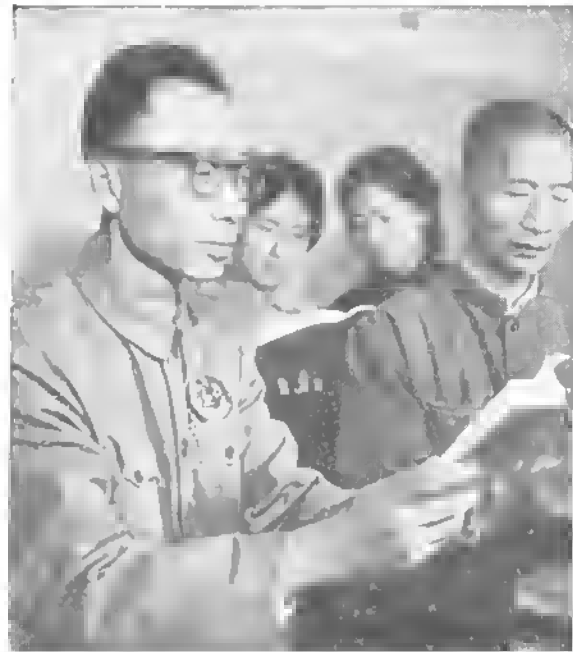
The author (left) studying Chairman Mao's works.